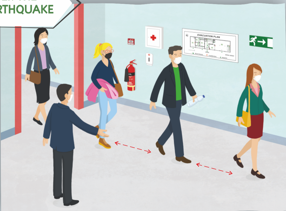
Evacuation of the building without panic