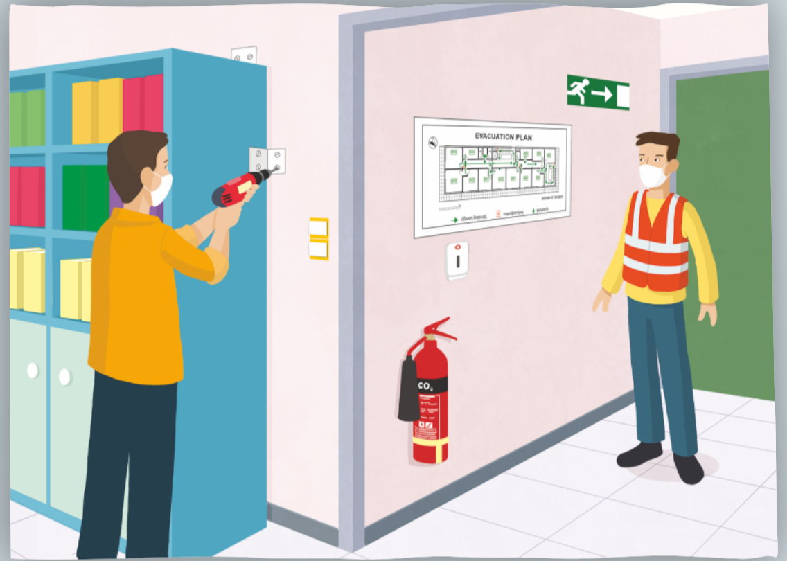
Identification and Mitigation of Potential Hazards