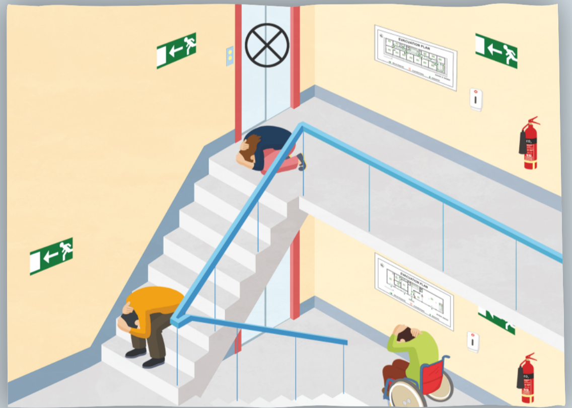
Avoid to move. Drop, Cover and Hold-on