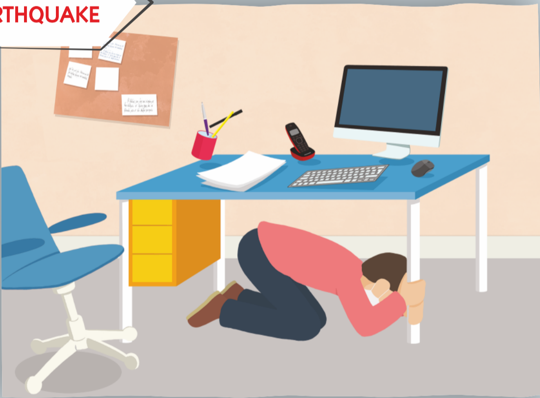
Cover under a desk and Hold-on to one leg